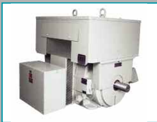
Above NEMA motors