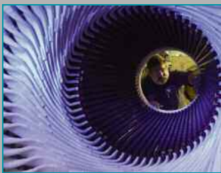
IntegraSeal™ B-stage coil rewind