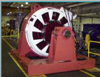
Run testing to 7,200 VAC / 700 VDC