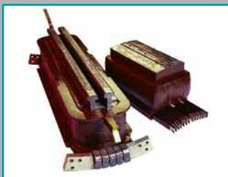
Remanufactured field coils - edge and wire wound

IPS Monarch Detroit 18800 Meginnity Drive Melvindale, MI 48122