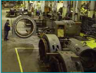
30-ton lifting capacity