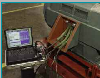
Motor Circuit Evaluation (MCE)

IPS Monarch Detroit 18800 Meginnity Drive Melvindale, MI 48122