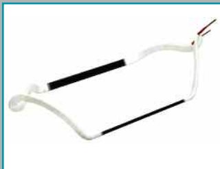
Spare stator coils up to 15 kV